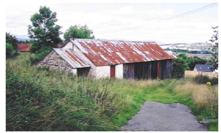
View of long out-building facing NE

Site 6 is an additional site that was found as part of this survey and is not recorded in the Highland Sites and Monuments Record or the National Monuments Record of Scotland, Edinburgh.