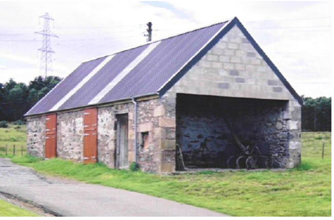
View of remodeled building facing NW

No recommendations to be made as site should be unaffected by route proposed currently.