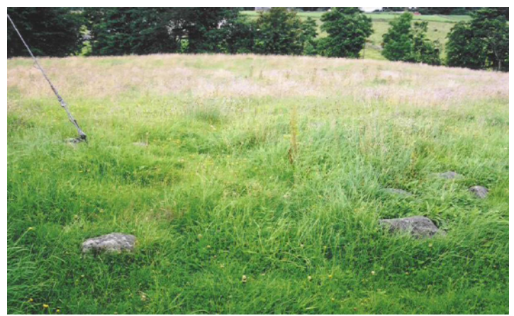
View of building facing North

No recommendations to be made as site should be unaffected by route proposed currently.