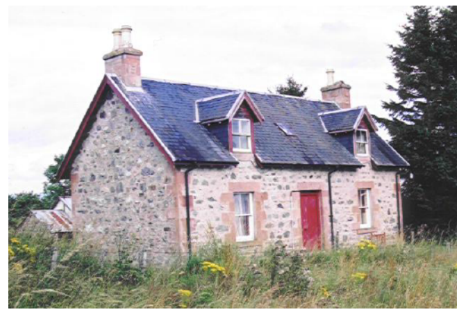
View of farmhouse facing NE

No recommendations to be made as site should be unaffected by route proposed currently.