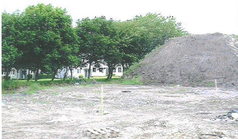
View of site before excavation facing NW