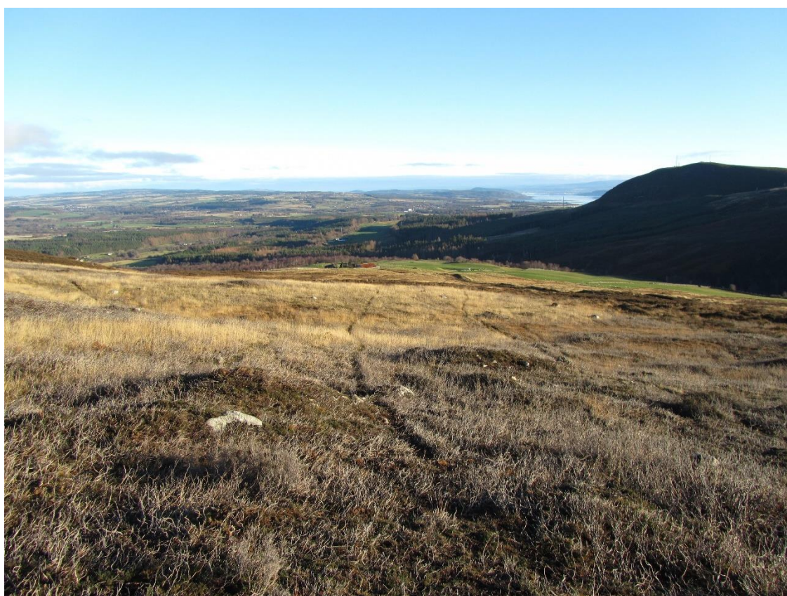
Field system of clearance cairns associated with new hut circle (N) at Cul Beag, looking N