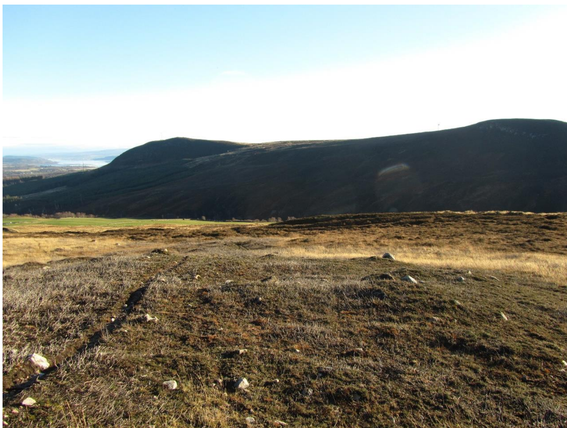
New hut circle (N) recorded Aug 2015 looking SE