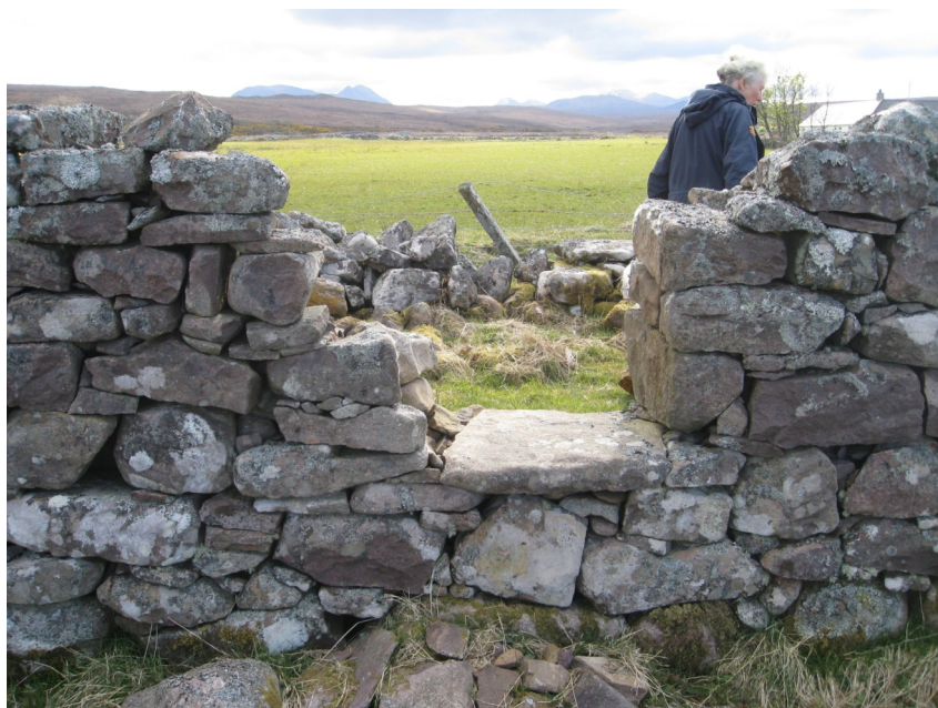
Looking out on to good fertile arable ground

Once there was a shop, slaughter house, fish curer, meeting house, but the children went to school at nearby Opinan.