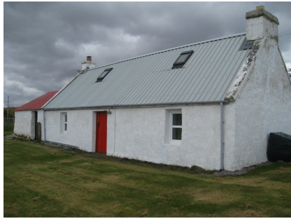
32 NG 74826 70866 28m Wall containing a lot of bog iron