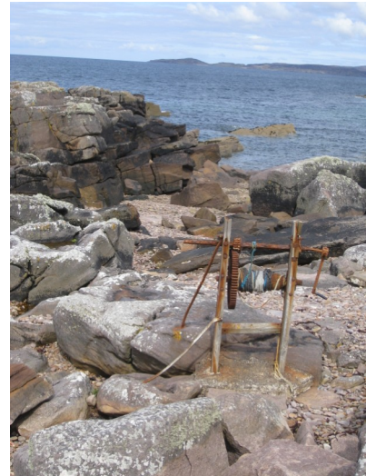
50 NG 73950 71356 19m Footings and lintel stone