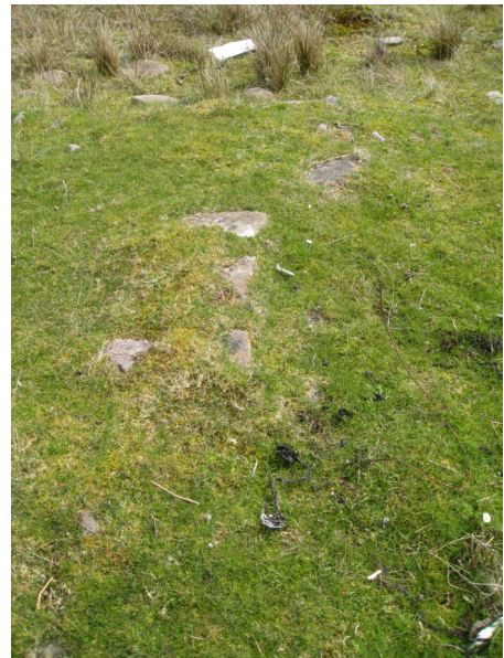
48 NG 73715 71382 3m old Home Guard hut relocated from Redpoint