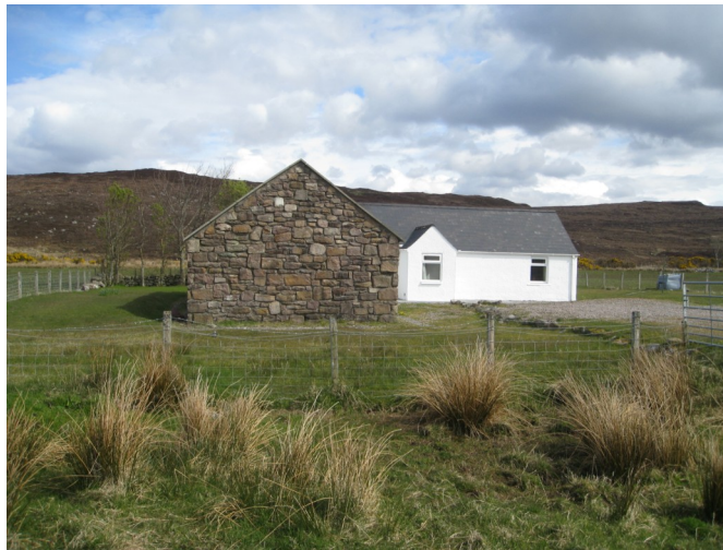
21 NG 74981 71136 29m group of 4 barns