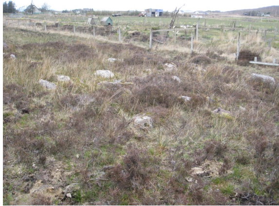
29 NG 74738 70913 21m ruined barn