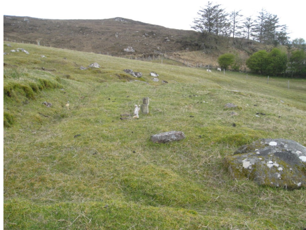
36 NG 74914 70842 35m ruined barn