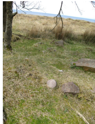
51 NG 73975 71349 20m house marked on 2nd OS