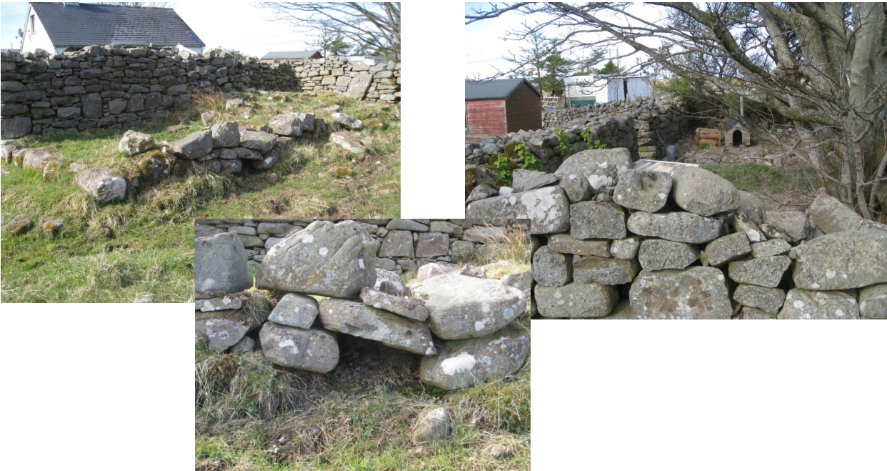
8 NG 74818 71167 30m ruined barn