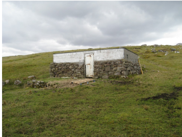
35 NG 74883 70838 37m footings