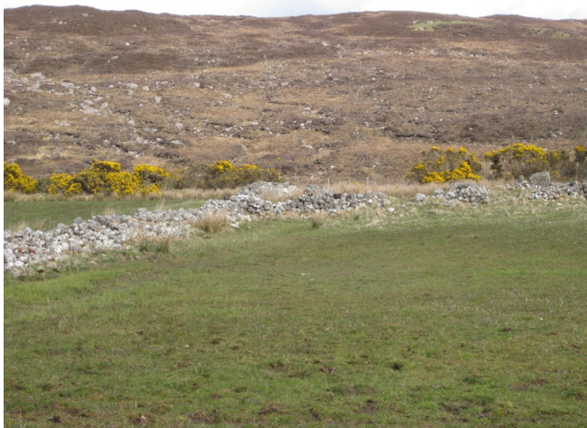
23 NG 74962 71098 35m Footings of building