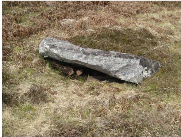
47 NG 73810 71483 4m bulldozed ruin