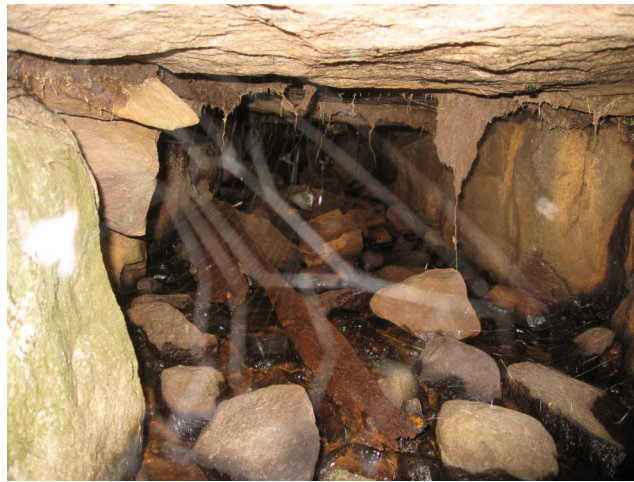
65 NG 75056 71238 28m Bank where clay for pointing houses was dug out