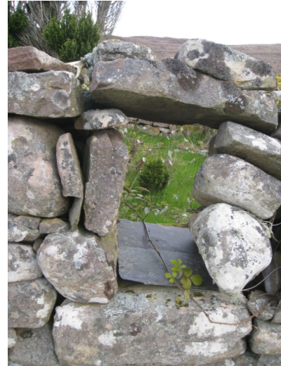
26 NG 75180 70947 37m Fank