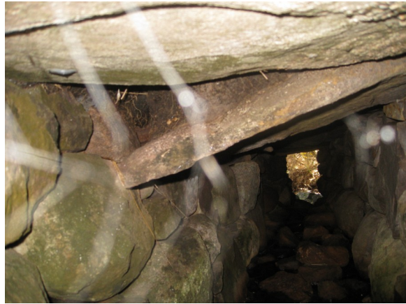
64 NG 74929 71292 30m Stone bridge width 4m