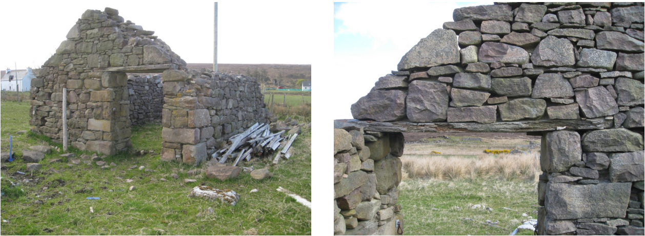
9 NG 74861 71250 29m ruined house