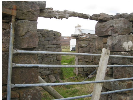
30 NG 74722 70880 27m two compartment ruin