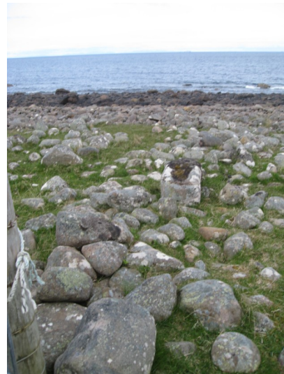
42 NG 73963 71664 5m plies of stone clearance at same place