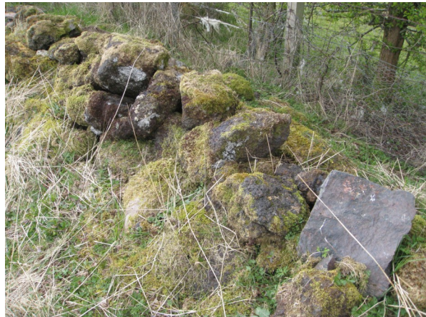
33 NG 74866 70867 29m ruined house