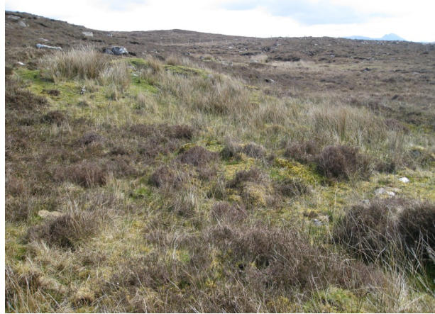
20 NG 74897 71157 30m house from 1st OS modernised