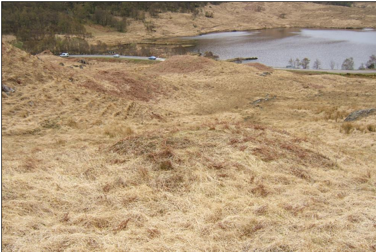
Putative platform MHG 30162, viewed from the north

The surface of this feature undulates considerably and not really suitable as a house platform. In addition, there was no evidence that it had been used as a charcoal-burning stance.