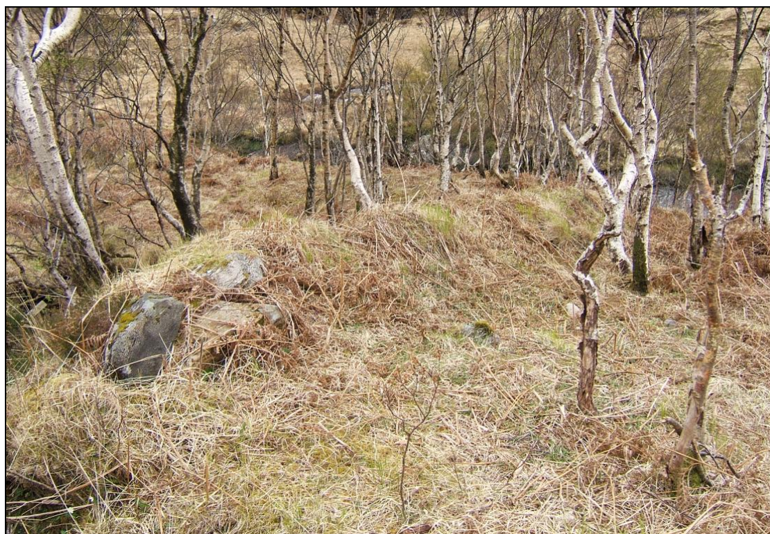
Turf bank approaching the river, viewed from the north