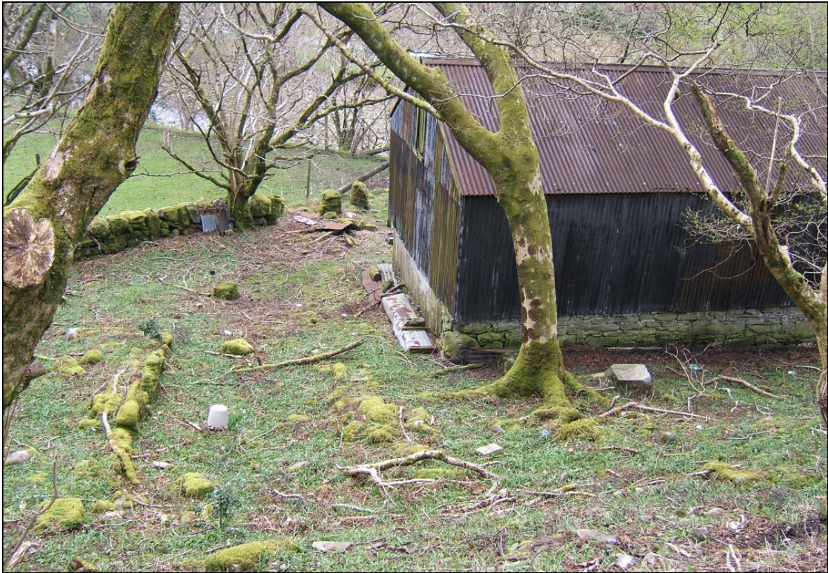
Structure at NM 76846 82334 with extant farm building to its right, viewed from the west

Adjacent to this structure is a much larger building with stone foundations 1.1m high supporting walls and roof of corrugated iron. This structure, currently used as a farm building, is shown on the first edition OS map of 1876 whereas the scant remains nearby are not although it is possible that they co-existed at some stage.