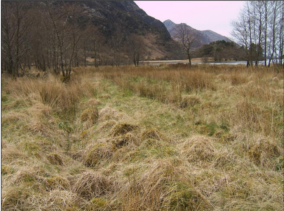
Putative lazy beds at NM 90685 80554, viewed from the north

The cultivation remains centred on NM 90685 80554 appear to comprise a series of lazy beds running north/south and measuring typically 2.2m between ridges.