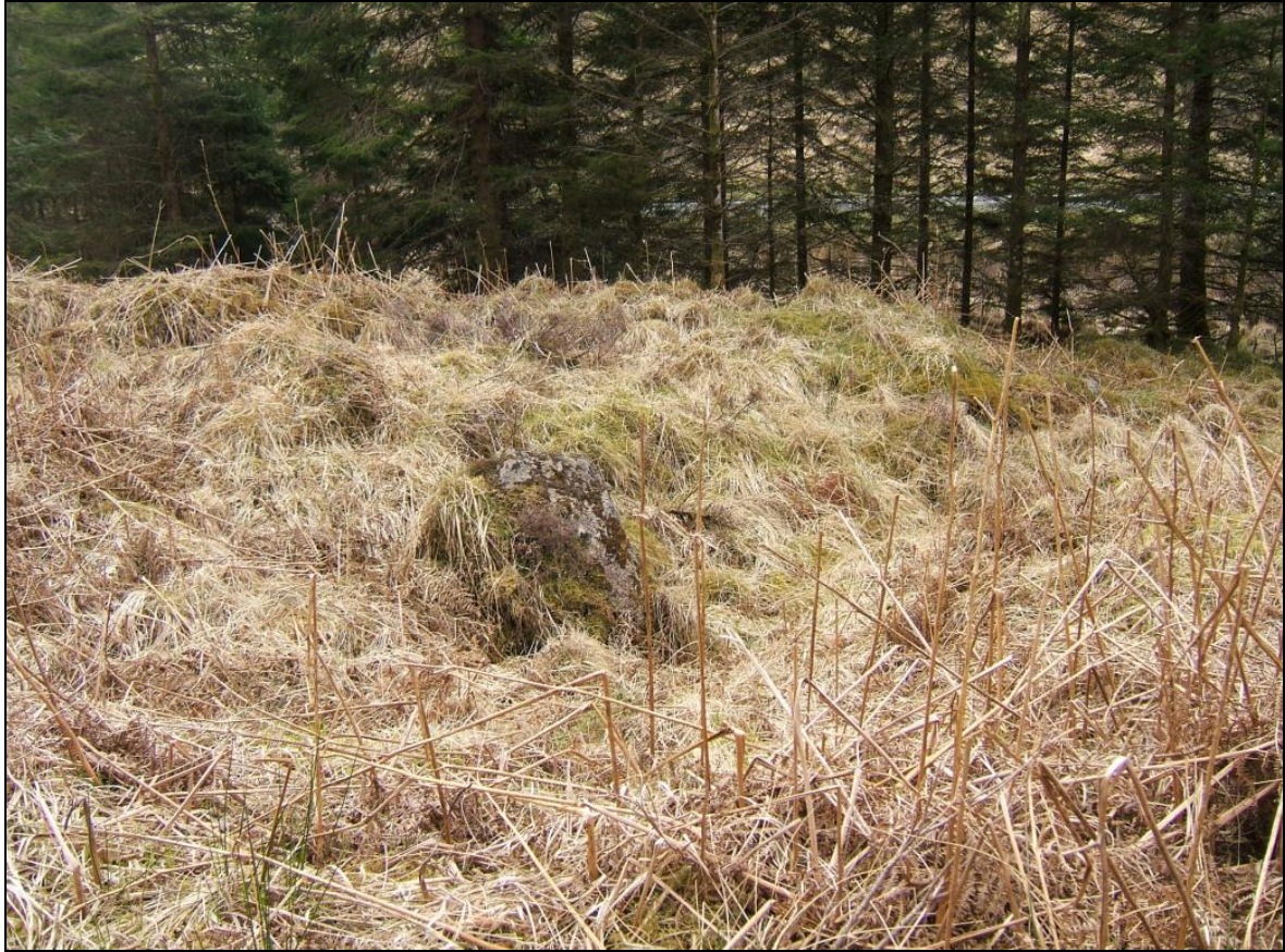
Putative borrow pit at NM 87842 81770, viewed from the south

At NM 87842 81770, within a cleared corridor through coniferous forestry, is what appears to be an artificial scoop, measuring approximately 12m by 12m. Its location, close to the A830 road, suggests that it was a borrow pit utilized during one of the road's phases of construction.