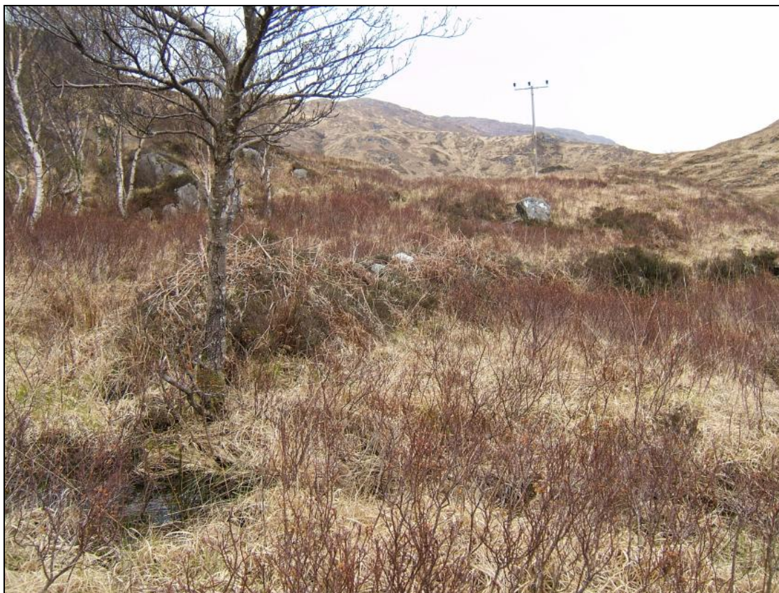
Turf bank at NM 77803 83031, viewed from the west