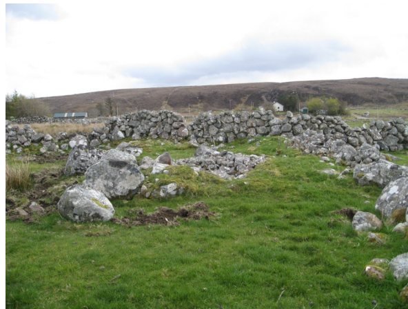
33 NG 90481 91248 39m enclosure