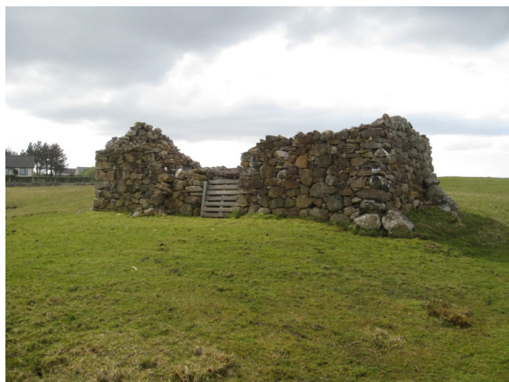
47 NG 90801 91574 20m barn/ byre with attached stackyard