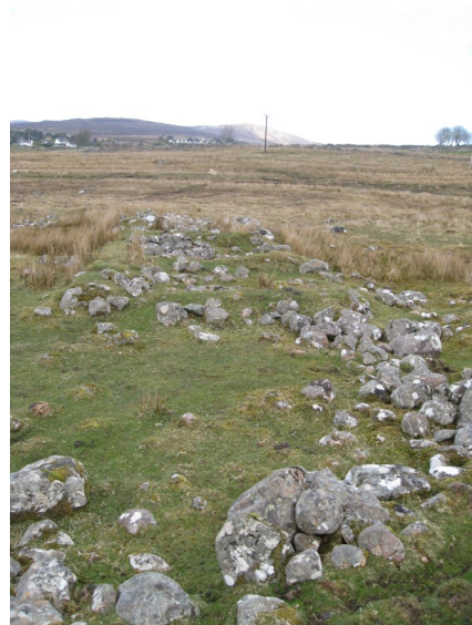
11 NG 90714 90776 40m Barn