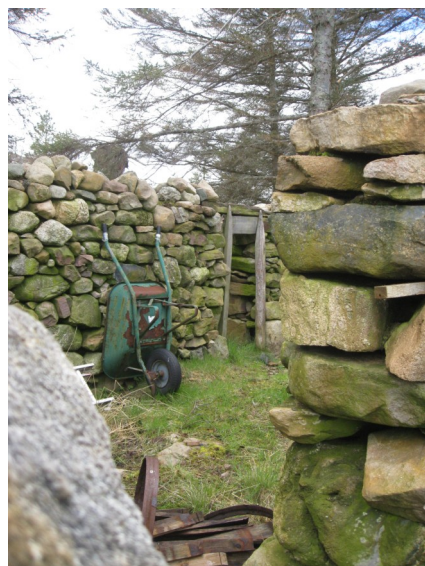
12 NG 90802 90797 41m House and barn