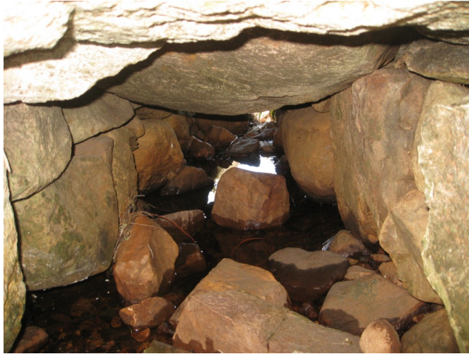
62 NG 90734 91552 13m ruin with attached enclosure