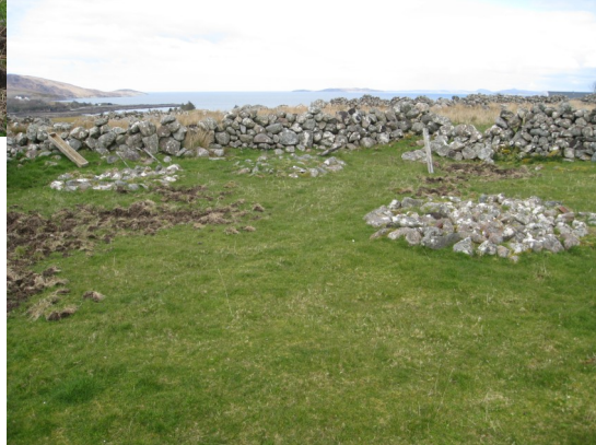
32 NG 90520 91223 41m footings of building attached to wall