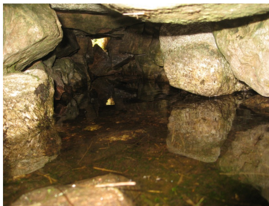
51 NG 91049 91167 39m ruin with four compartments with attached enclosure