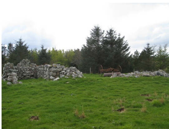
48 NG 90750 91615 12m byre with drain