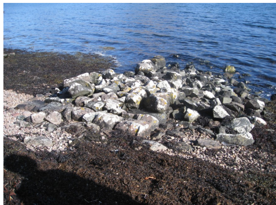
12 NG 84606 54782 3m wall and bothan