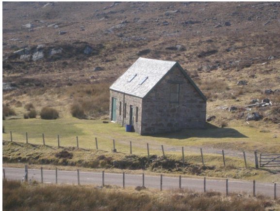
24 NG 84499 54414 23m ruined house/barn