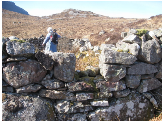
33 NG 84411 54240 35m house with garden and barn with old road running behind it.