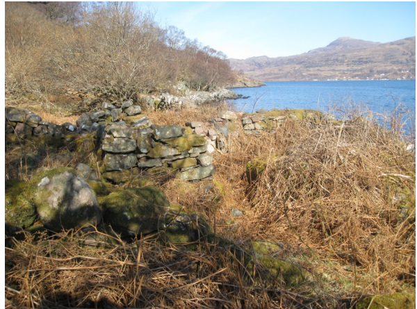
11 NG 84639 54761 1m jetty