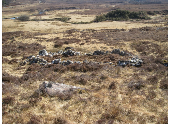
32 NG 84443 54291 30m building