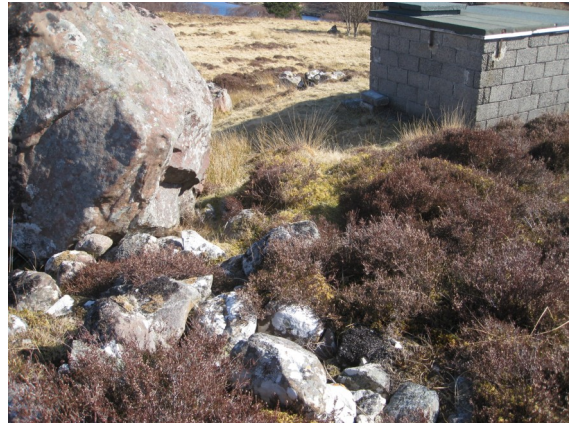
23 NG 84497 54355 25m deer larder