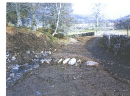
One of 7 groins protecting the route