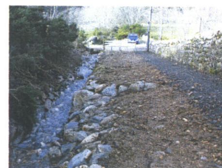
Stone lined drain and groin