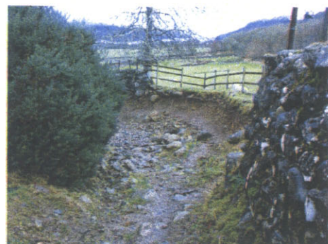
Wall collapse and washout