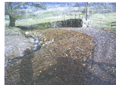
Buttress and drainage work