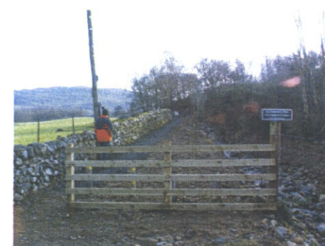
At Ardachy Road