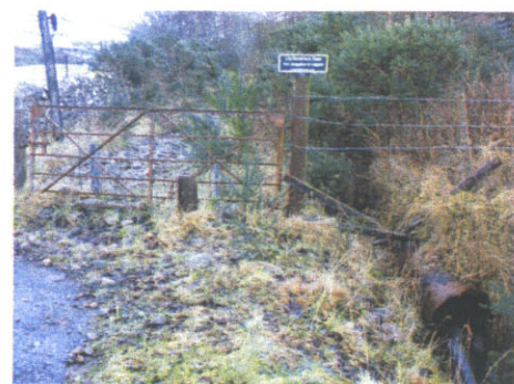
At Ardachy Road