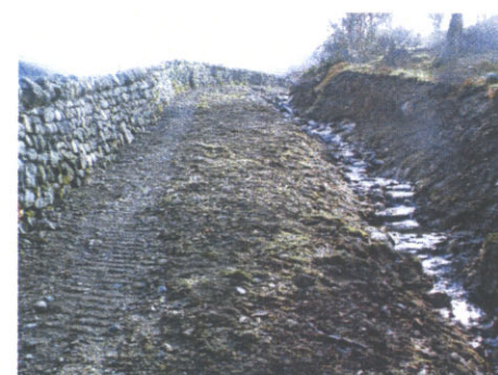
Wall reinstatement and buttressing