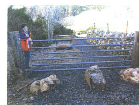
Stock gate and vehicle blockers