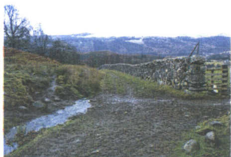
Top of section drain