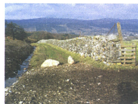
Drain clearance and blockers