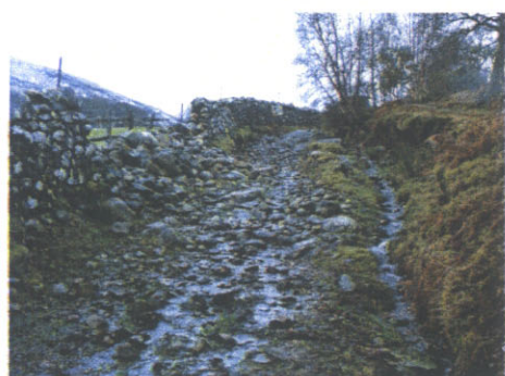
Wall collapse and washout